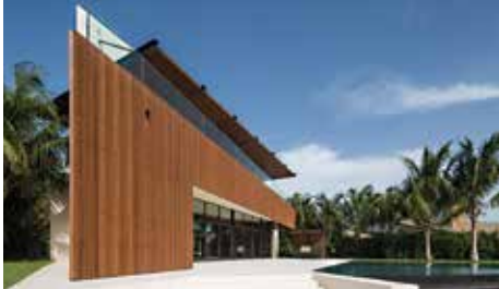
Private | Florida