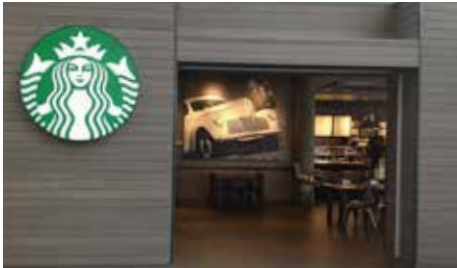
Coffee Shop | Brooklyn, NY

All its very exceptional properties make Resysta extremely resistant to weather influences like sun, rain, snow and ice, salt- and chlorine-water. Resysta does not swell, crack, splinter or rot. We provide a limited warranty up to 25 years in residential applications and up to 15 years for commercial.