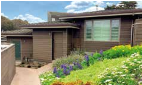
Country Club | Manhattan Beach